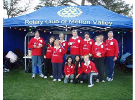
Relay for Life participants. Are they really sleeping?????????