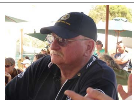
Pres must be concentrating on the moves of the belly dancers